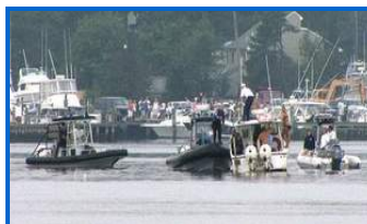
A DOWNED PLANE WAS SUBMERGED FOR TWO DAYS IN SILT DEEP ENOUGH TO HIDE THE FUSELAGE FROM RESCUERS.

When this sediment rises, it smothers aquatic life on the bay floor and reduces the amount of water in the bay. With less water, the bay has more extreme temperatures and can lose oxygen rapidly, leading to fish kills, algae blooms, weeds, and other harmful environmental impacts.