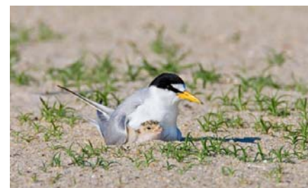
The Least Tern is the smallest of the North American terns (about 9 in. in length), a black-capped tern with white under parts and gray upper body, wings and forked tail. The Least Tern is distinguished by its sulfur yellow bill which is tipped black.

colony in Belmar had over 350 birds and fledged over 200 chicks, which makes it a huge success and the most productive site in the state.